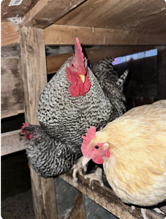
In the gentle ripple of a Minnesota lake and the quiet hum of the bee garden, your spirit...