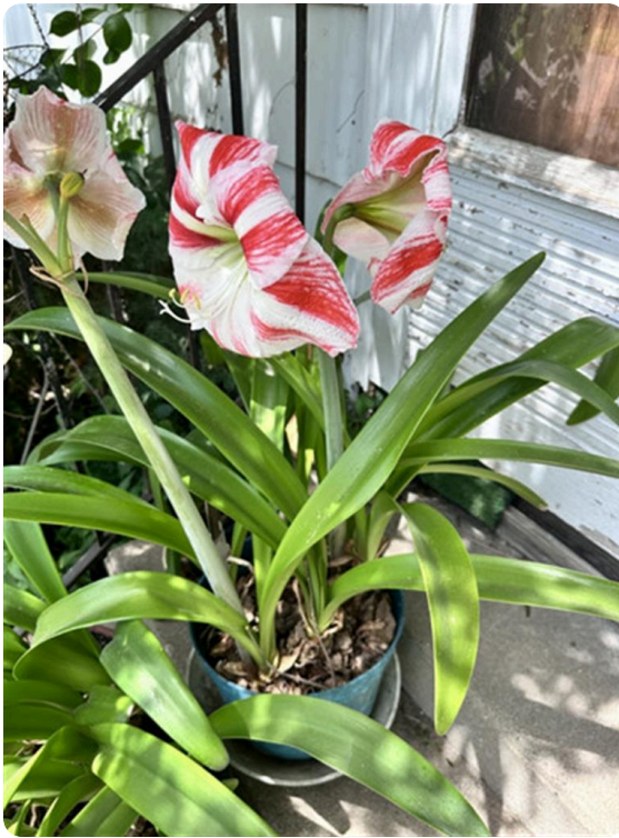
In the gentle ripple of a Minnesota lake and the quiet hum of the bee garden, your spirit...