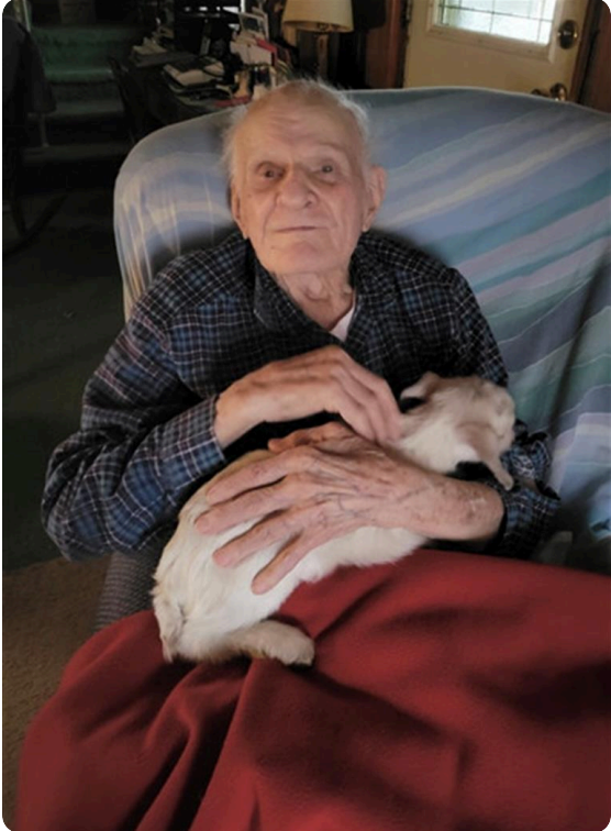
In the gentle ripple of a Minnesota lake and the quiet hum of the bee garden, your spirit...